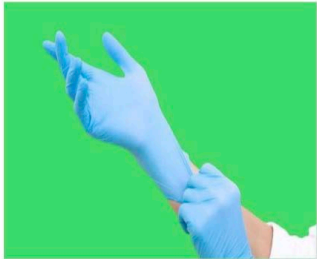
Ambidextrous, beaded cuff, smooth palm texture